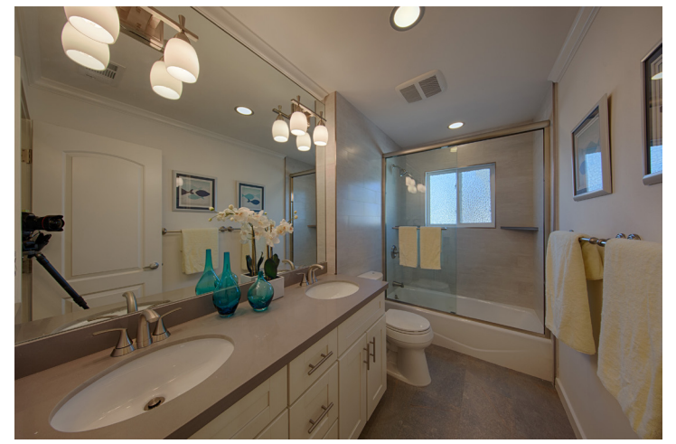
7778 Lilac Way, Cupertino - Neighborhood Attractions