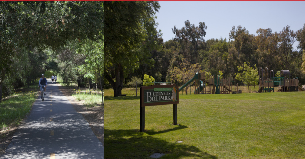
The Bol Park Bike Path , 5.4 miles round trip