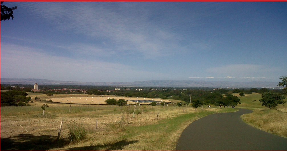
The Stanford Dish Hiking Trail , 4 miles long