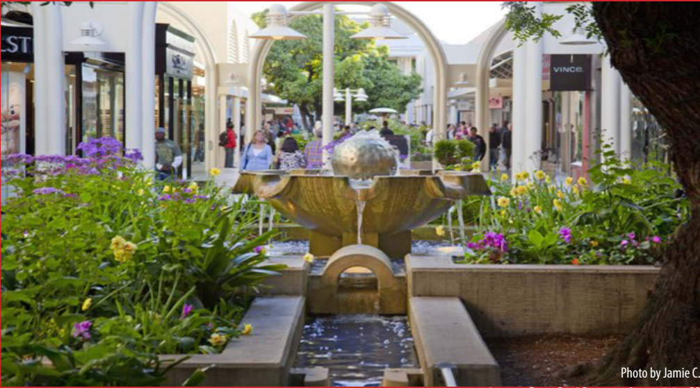
Stanford Shopping Mall